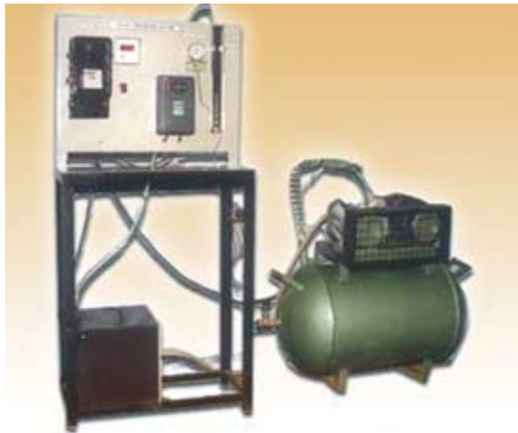
Measuring efficiency of compressor.

Energy is available in various forms from different natural sources such as pressure head of water, chemical energy of fuels, nuclear energy of radioactive substances etc. All these forms of energy can be converted into electrical energy by the use of suitable arrangement. In this process of conversion, some energy is lost in the sense that it is converted to a form different from electrical energy. Therefore, the output energy is less than the input energy. The output energy divided by the input energy is called energy efficiency or simply efficiency of the system.